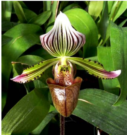
Paphiopedilum fowliei x hennisianum, grown by Paramount Orchids and photographed by Chuck Morin. Photo copyright Paramount Orchids.