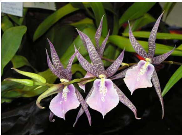
Miltassia Charles Marden Fitch "Izumi" (Brassia verrucosa x Miltonia spectabilis), part of the FOS display at the Foothills Orchid Society show in September.